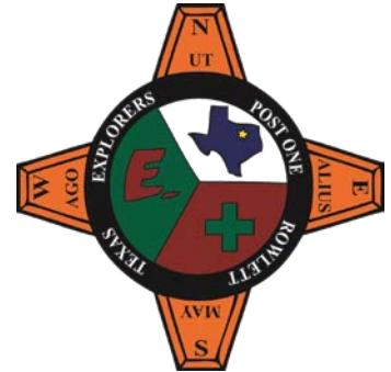
Figure1: Rowlett Explorer Post One Official Logo

Alternatively, Explorer "E" may be used at the Explorer Advisor's discretion. The "E" in CERT may be replaced by the Explorer "E" to create a stylized effect or logo. The Post Motto shall be, "We Are One".