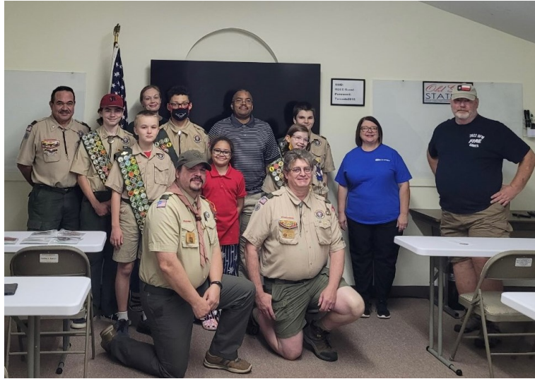
BSA T646 B First Official Meeting at Old Glory!

BSA Troop 646 has already been busily contributing to our community. Trash pick-up, food donation collections, weekly meetings and an upcoming camp-out are the scouts' focus this Fall.