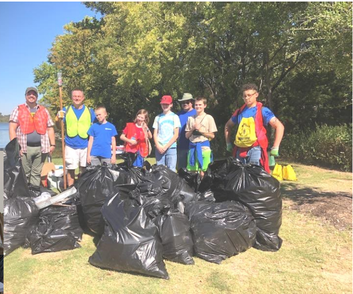
Tri-City Cleanup T646 Collected 29 large trash bags