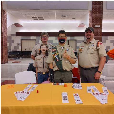
T646 at Rowlett COAD Disaster Preparedness Fair