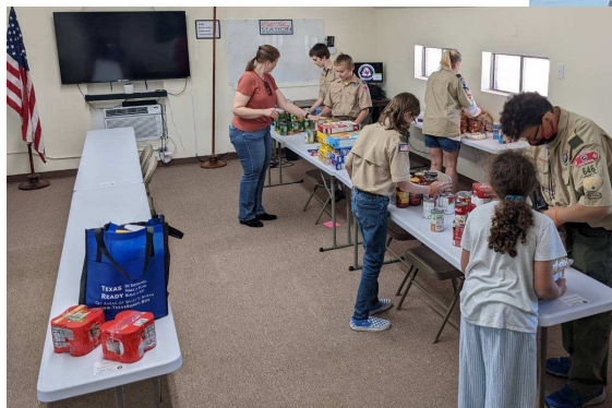
T646 Scouting for Food