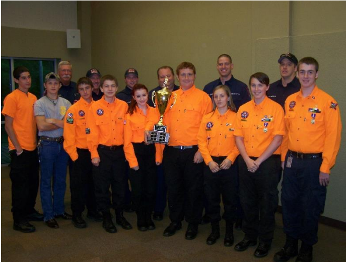
Class A Uniforms