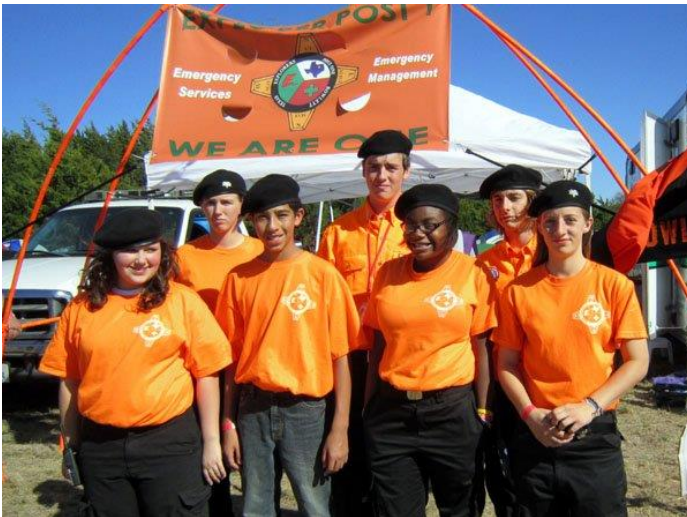
Class B Uniforms