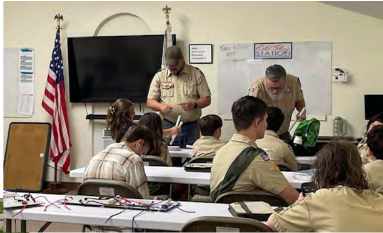
Weekly Meeting working on lashing

Scouting America Troop 646 now has a female troop. Both the female and male troops meet on Mondays between 7-8:30PM at Old Glory. If you know of any youth between the ages of 10.5 through 17 years, have them swing by our weekly meetings at Old Glory for a visit. We camp monthly, and camp for a week at Summer and Winter Camps.